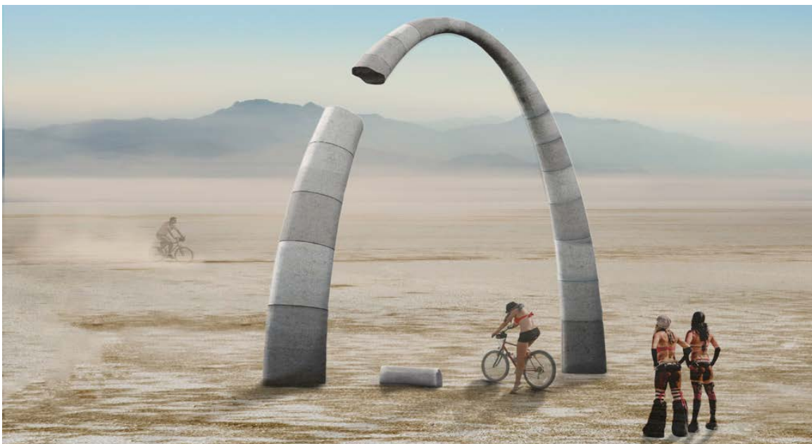
RESOLUTE ARCH IN BLACK ROCK CITY, VISUALIZATION

"The act of forming meaning has atrophied in contemporary culture. Artworks that visually challenge us, open symbols, offering neither pre-packaged explanations nor pat conclusions, exercise our faculties, forcing us to resolve our perceptions and excavate our baseline value systems. Powerful and fragile, durable and temporary, discontinuous and resolved, Resolute Arch is a portal open to the meanings and revisions of our culture, past, present, and future."