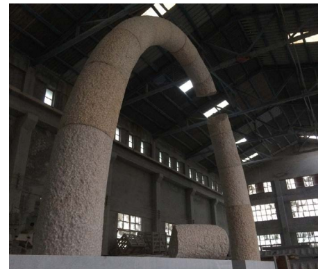
RESOLUTE ARCH HALF SIZE PROTOTYPE, PHOTOS