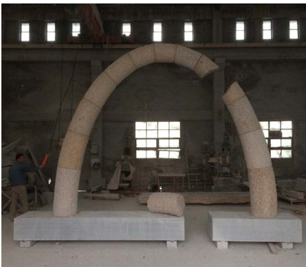
RESOLUTE ARCH HALF SIZE PROTOTYPE, PHOTOS WITHOUT BACKGROUND

for photos, 3d model, plan and section of Resolute Arch.